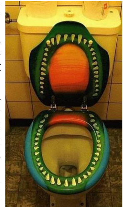
Somehow I picture the toilet flush sounding like OMNOMNOMNOM