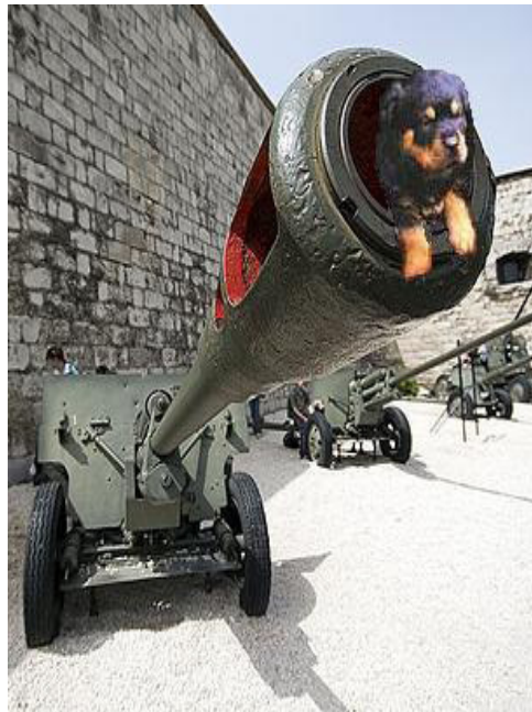
Cutest ammunition ever. Even more fun to load it, don'cha think?

The Guy- "After a few hits from one of these babies, even battle hardened soldiers will fall to their knees and scream WHY GOD WHY, arms held to the sky. There's really nothing like knowing you are the