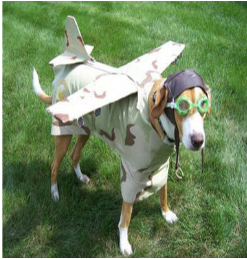
Some how I don't think that there'll be many dogs signing up for military service after this. I could be wrong, but...